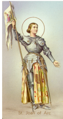
St. Joan of Arc

Saint Joan of Arc Feast day is celebrated on May 30th.