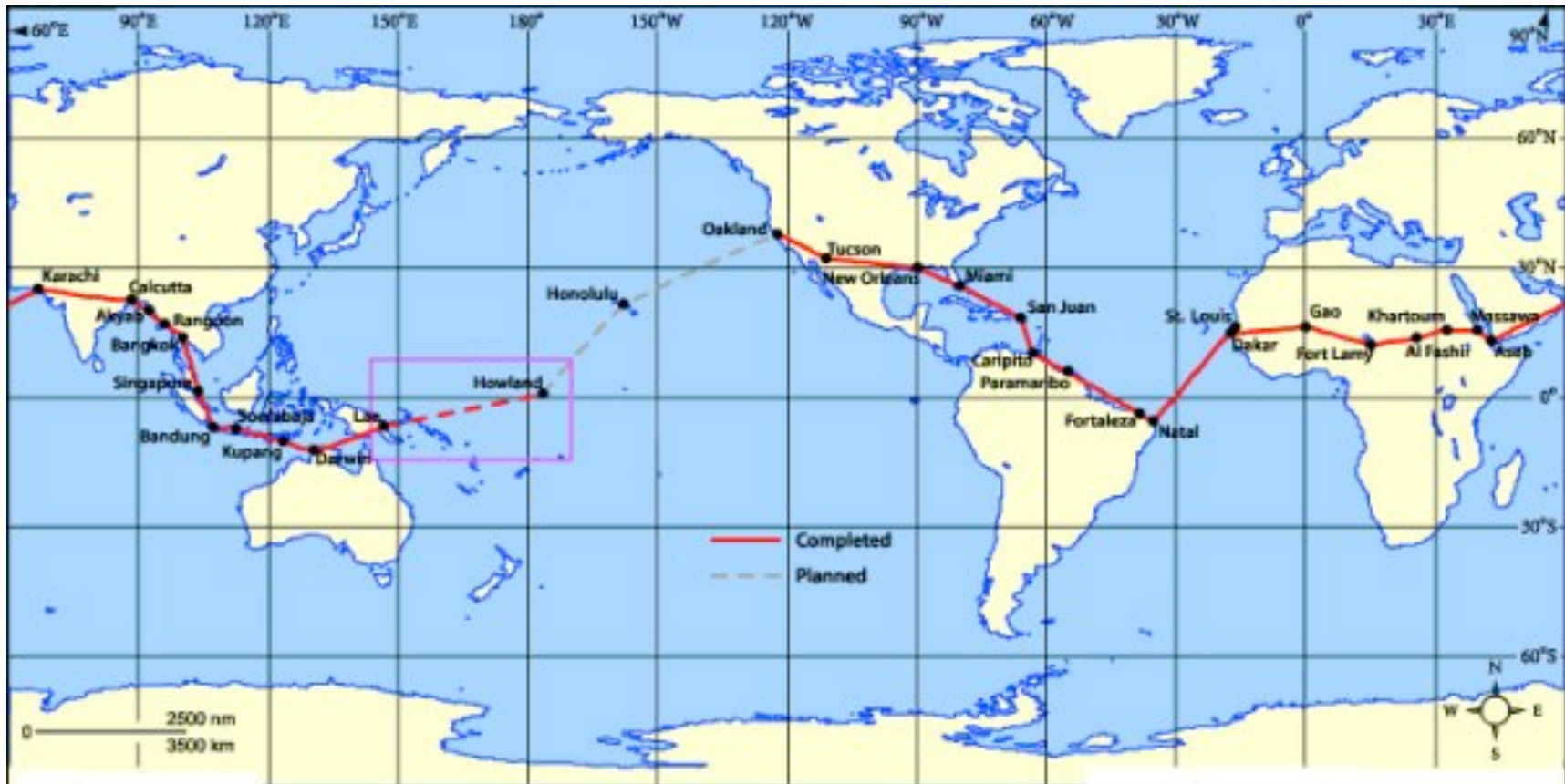
Amelia's flight plan for trip around the globe