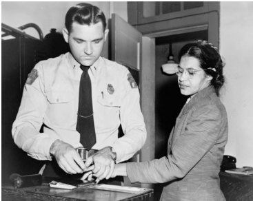
She was arrested, booked, fingerprinted and jailed