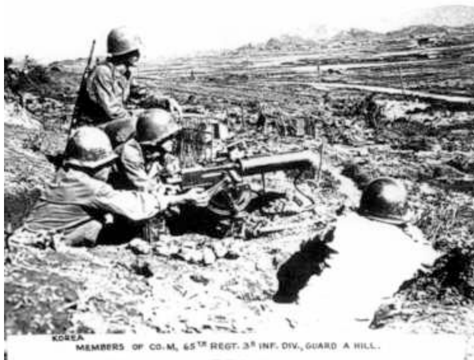
KOREA MEMBERS OF CO. M, 65 TH REGT. 3 RD INF. DIV., GUARD A HILL.