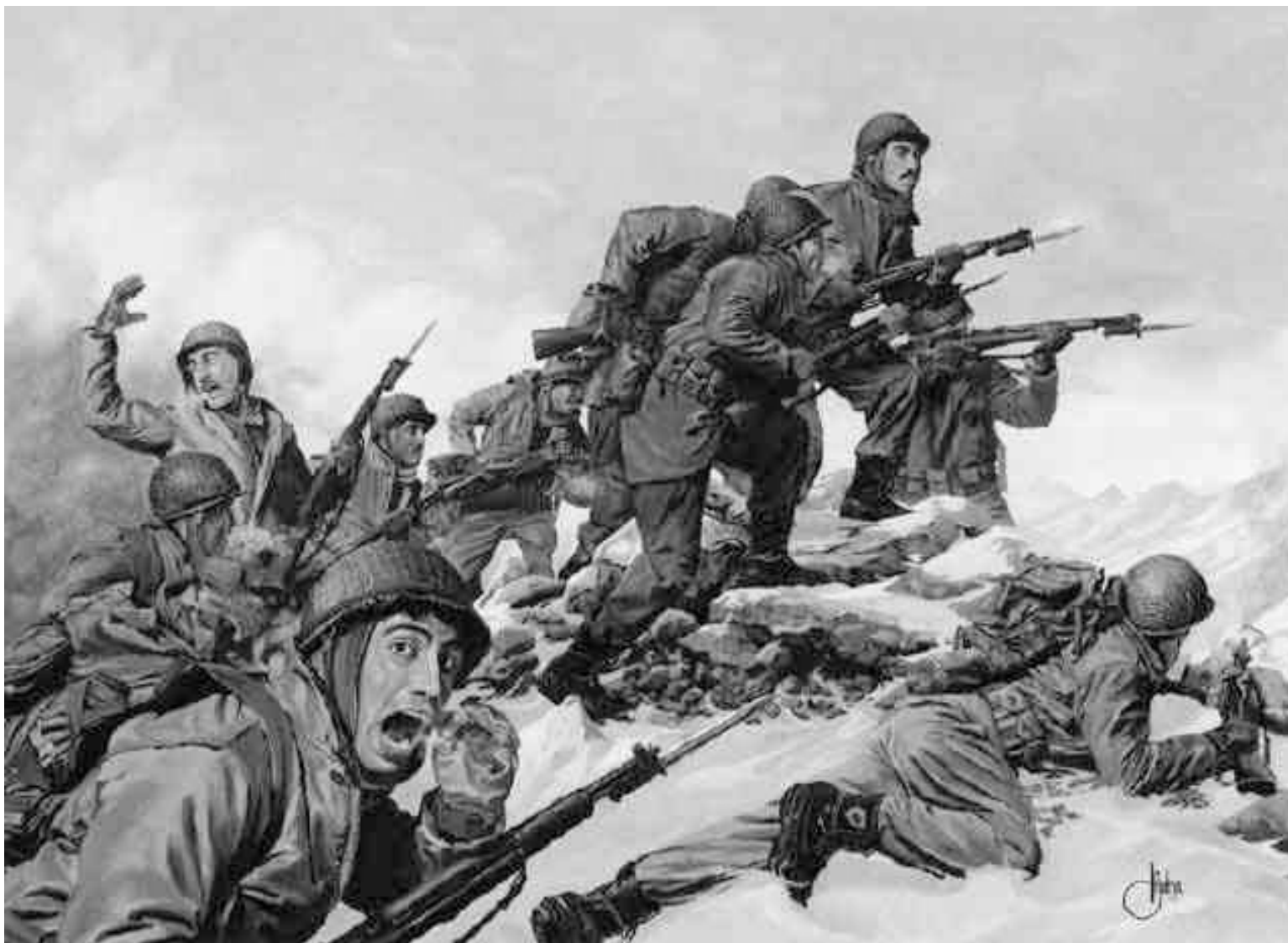
Puerto Rico's 65th U.S. Infantry Regiment. The battle portrayed in the painting was the last recorded battalion-sized bayonet attack by the U.S. Army.