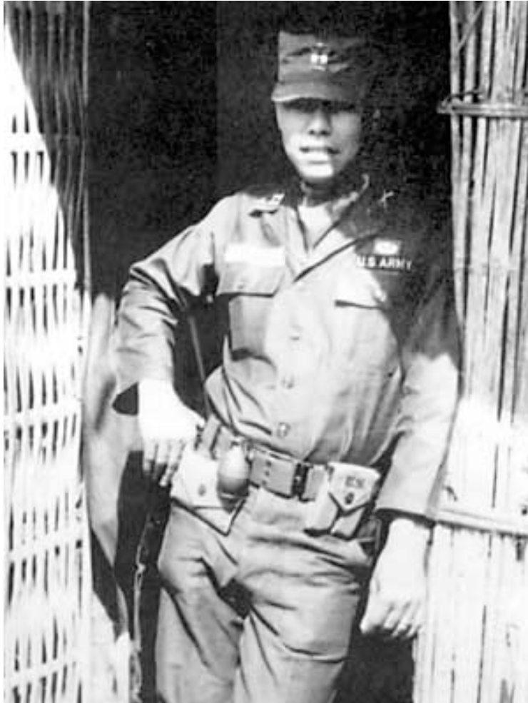
Powell in Vietnam