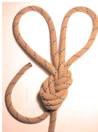
Double Figure Eight Loop