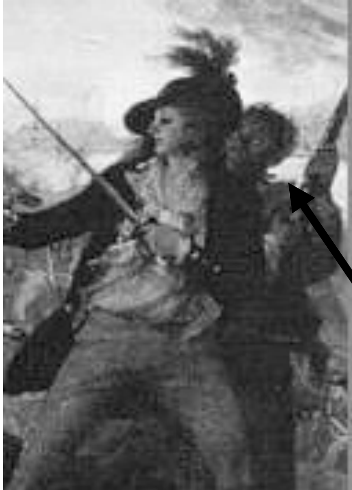
“Battle at Bunker’s Hill”