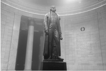
The interior of the memorial has a 19 foot tall, 10,000 pound bronze statue of Jefferson, which was added four years after the dedication. The interior walls are engraved with passages from Jefferson's writings.