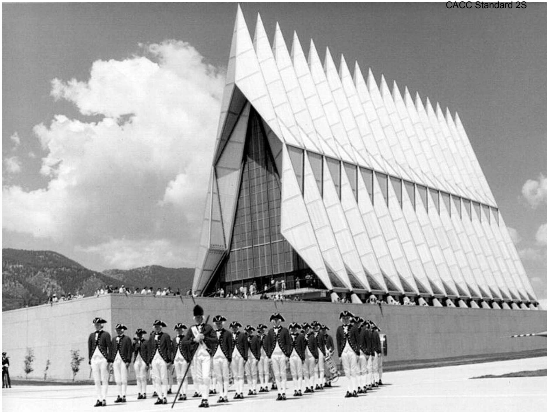
TA Training Aid 27-T-7 Last Modified 15 DEC 06