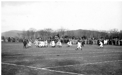
The first Army - Navy football game 1890 Navy won 24-0