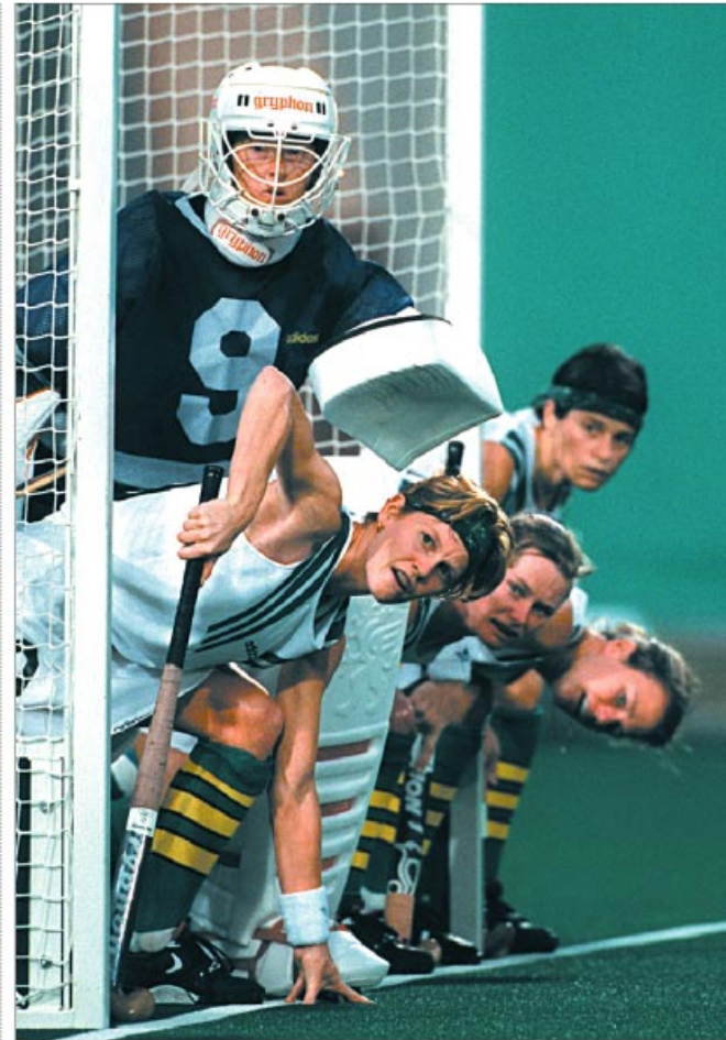
Hockey's origins date back as far as 4,000 years. It is believed to be the world's oldest stick-and-ball sports. Defenders on the Australian women's field hockey team are shown above preparing for an attack in the 1996 Games at Atlanta.

The ball is made of solid plastic. It weighs about 5.5 ounces and is about 9 inches in circumference.