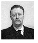
Teddy The Youngest President