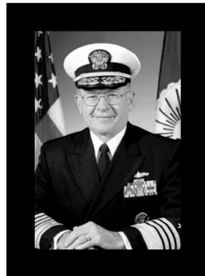
Chief of Staff Navy