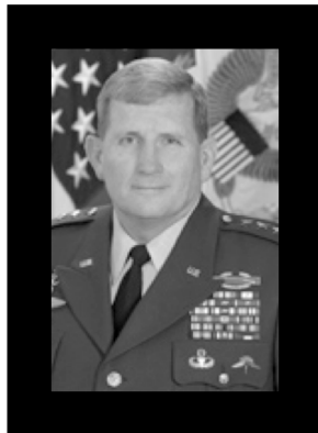
Chief of Staff Army