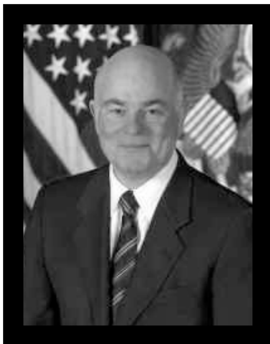
Francis J. Harvey