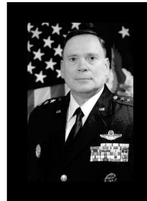
Chief of Staff Air Force