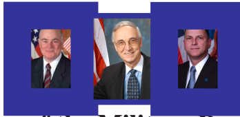
Secretary of the Military Department