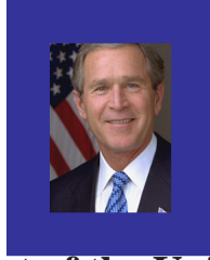
President of the United States Commander in Chief