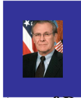
Secretary of Defense