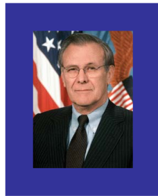
Secretary of Defense