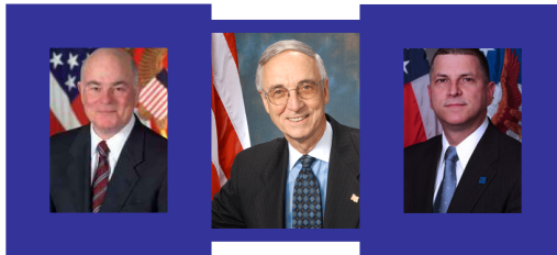
Secretary of the Military Department