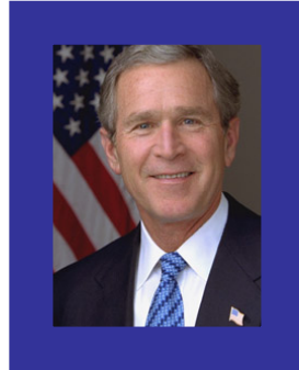
President of the United States Commander in Chief