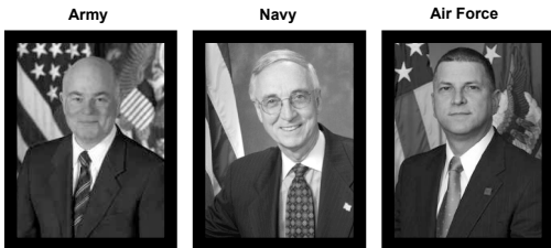
Francis J. Harvey Gordon R. England Michael L. Dominguez