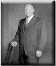
If you can walk with crowds and keep your virtue, Or walk with kings—neer lose the common touch. —"If" by Rudyard Kipling